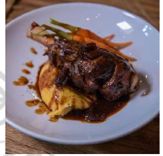
Savoury NZ Lamb Shank