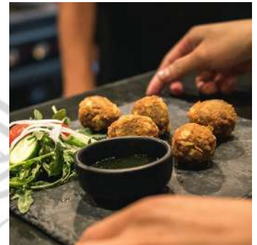
NZ Spring Lamb Croquettes