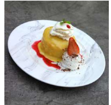
Kai Lemon Pudding