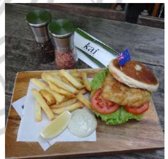
NZ Fish Burger