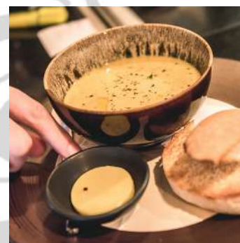
Kai Seafood Chowder