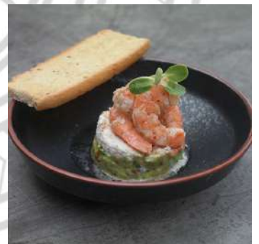
Crab & Prawn Tower