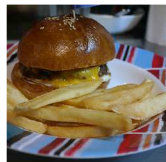
Kids Beef Cheeseburger & Chips

All NZ Chips can be replaced with a Mini Zealandia Salad