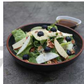
Blueberry Apple Walnut Salad

Cos Lettuce, Kai Crispy Bacon, Chopped Anchovies, Parmesan Cheese, Croutons, Kai Caesar Dressing