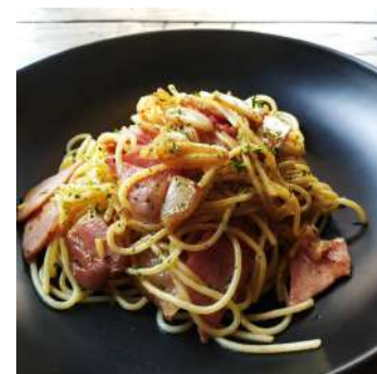
Spaghetti Aglio Olio Bacon

Spaghetti tossed in Rocket Pesto, Cherry Tomato, NZ Avocado Topped with Manuka Smoked Premium Salmon Trout