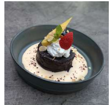
Jack Daniel's Chocolate Mud Cake