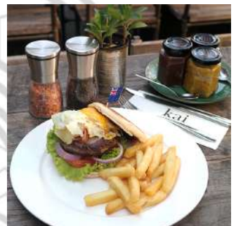
Kai NZ Burger