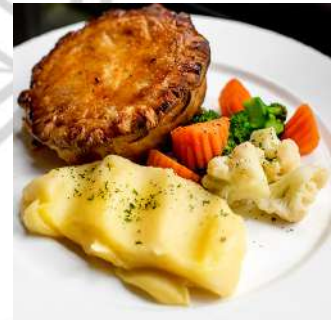
Kai Pie of the Day